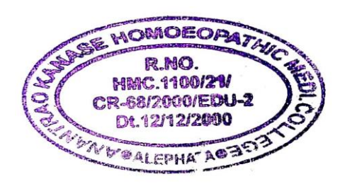
Principal Anantrao Kanase Homoeopathic Medical College & Hospital Alephata