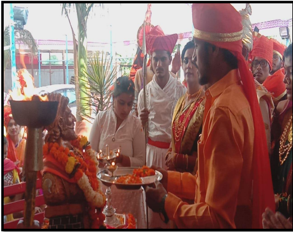
Shivajayanti 19 Feb 2020